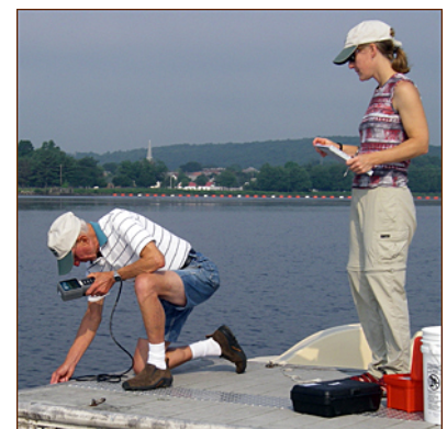
CRWC Water Sampling Turners Falls

Starting in late May a team of GNWA members will be collecting samples of river water from the Pauchaug State Boat Ramp on a biweekly basis as part of the Connecticut River Watershed Council's bacteria monitoring project. Samples are