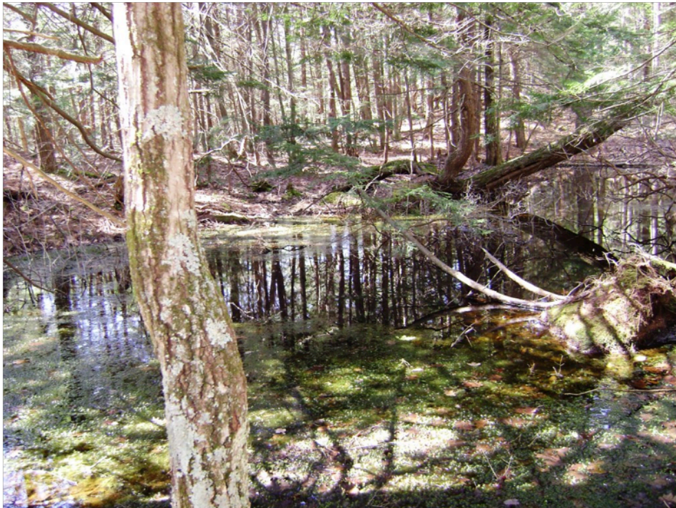
Vernal Pool, Northfield Town Forest

GNWA is considering joining with one of these non-profits in their efforts to prove that this proposed pipeline presents environmental costs that exceed the need for a new gas infrastructure of this magnitude. Individuals, too, can comment on these hearings, or can join PLAN-NE to be a part of their comments, especially useful if you are a gas customer, or a landowner directly affected by the pipeline. These legal efforts do require significant amounts of money, and contributions are always welcome. Contributions to PLAN-NE can be made online at http://www.massplan.org/coalition-members/ .